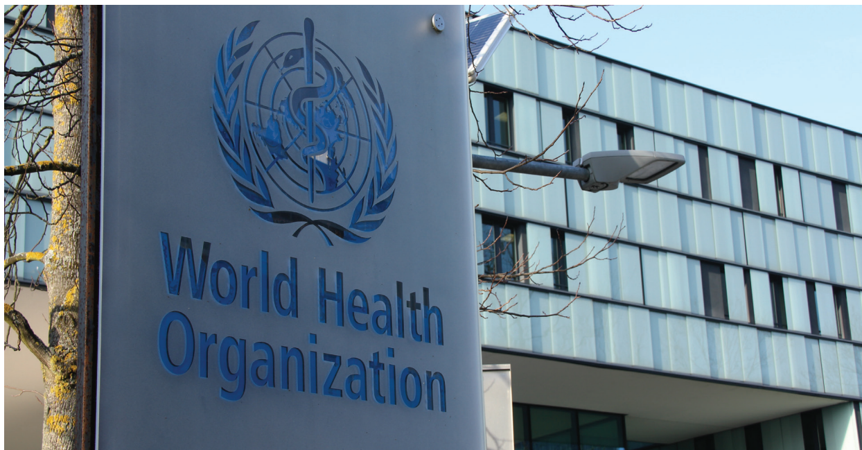
Sede de la Organización Mundial de la Salud (OMS) en Ginebra.