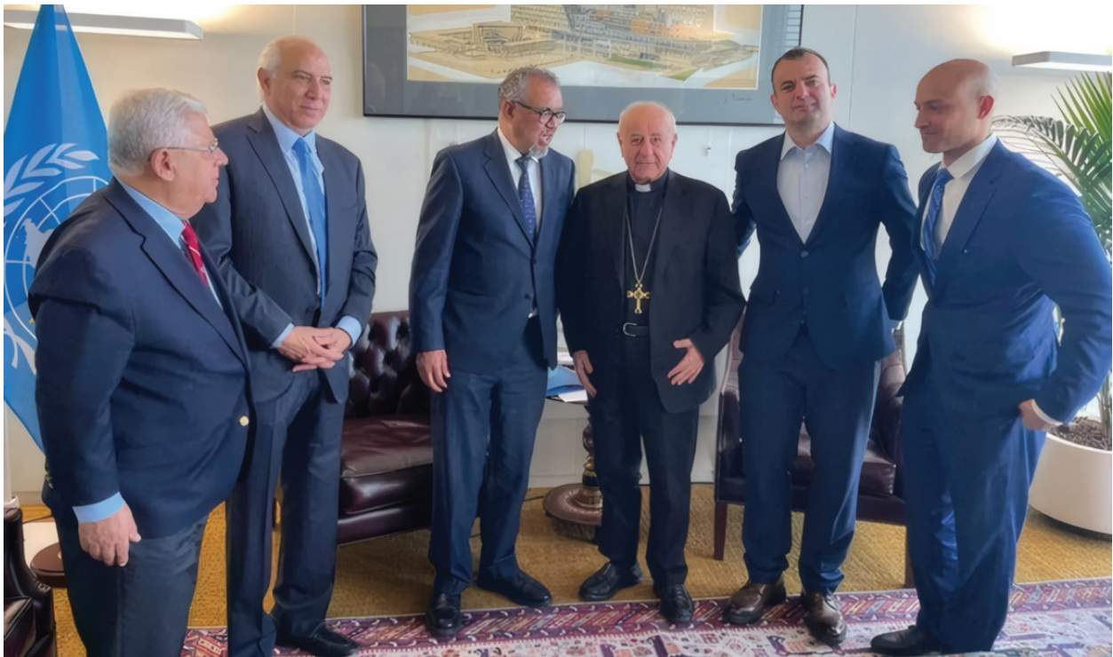
Meeting of the campaign steering committee at the World Health Organization (Geneva) with its Director-General, Dr. Tedros Adhanom Ghebreyesus.