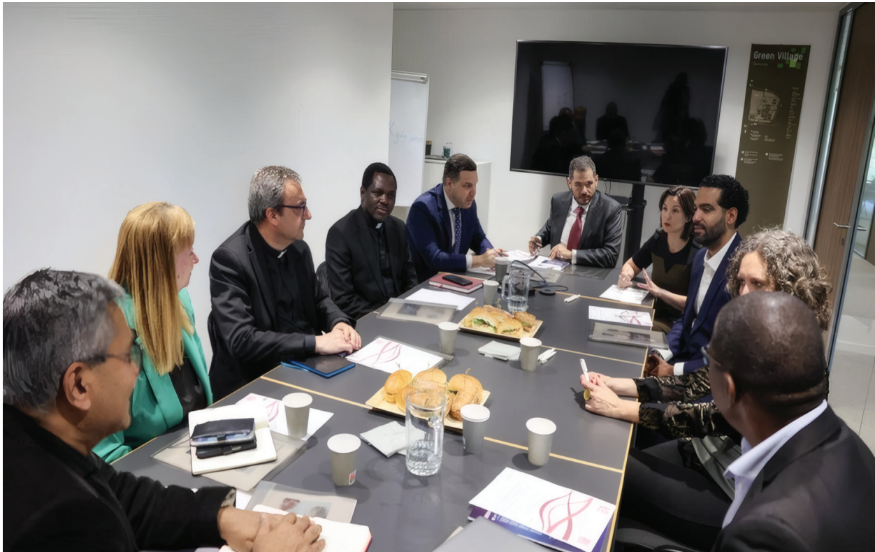
Meeting between the campaign team and a representative of the Pontifical Academy for Life with a member of the World Council of Churches (Geneva).