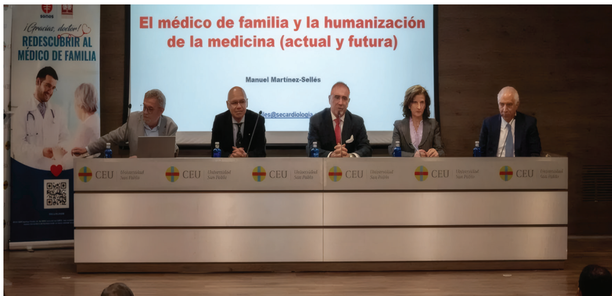
Presentation of the campaign at CEU San Pablo University, Madrid.